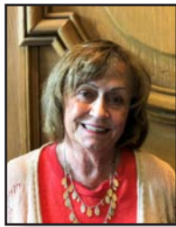
Bernice 'Bernie' S. Eshoo