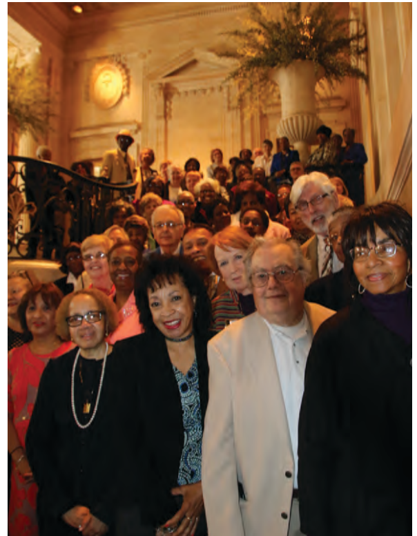
Recruit a friend to join RTAC as a Life Member and both of you could win a special prize announced at our May luncheon.

Your membership in RTAC is an investment in your retirement security. Encourage a friend to join today.