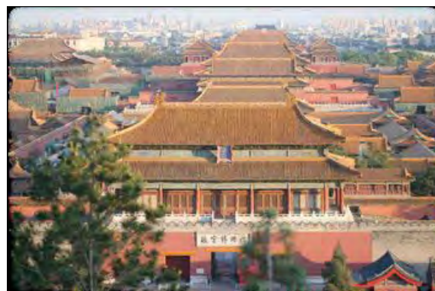
The Forbidden City