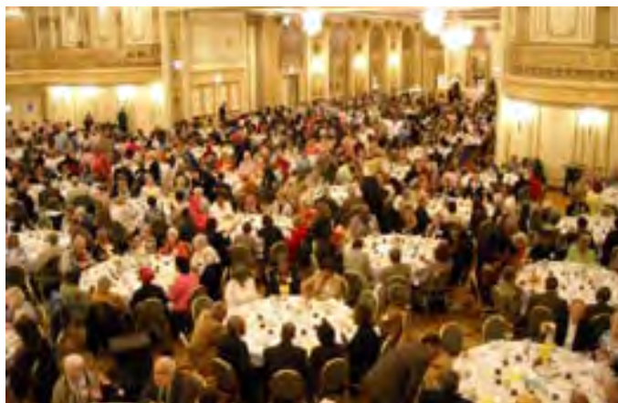
A record 840 members packed the 2010 Spring Luncheon.