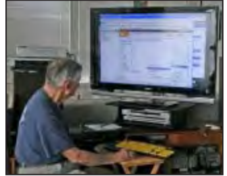
V.K. at his workstation

There are several large-print USB based wireless keyboard and mouse combinations available today. We selected the high-visibility bright yellow with large black lettering combination sold under the name KeysUSee.