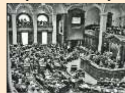
These are the people IGAM interacts with to protect YOUR pension.