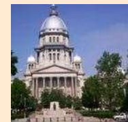
This is where IGAM works to protect YOUR pension.