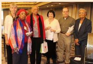
Additional Door Prize winners (From left to right.)